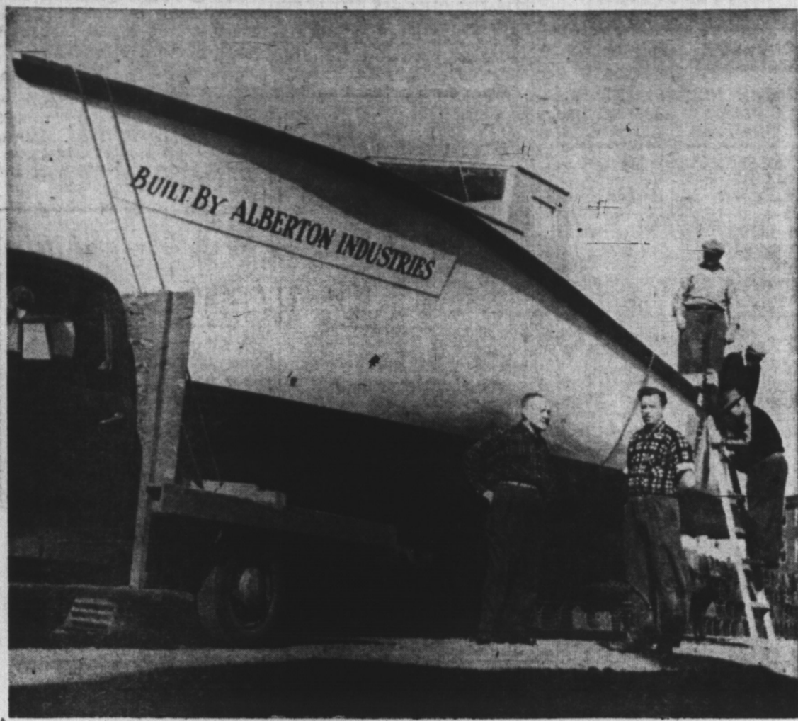
SAMPLE SHOWN OF ALBERTON INDUSTRY

With a 40-foot sample of Island industry in the form of a newly built fishing boat aboard a truck drawn trailer,