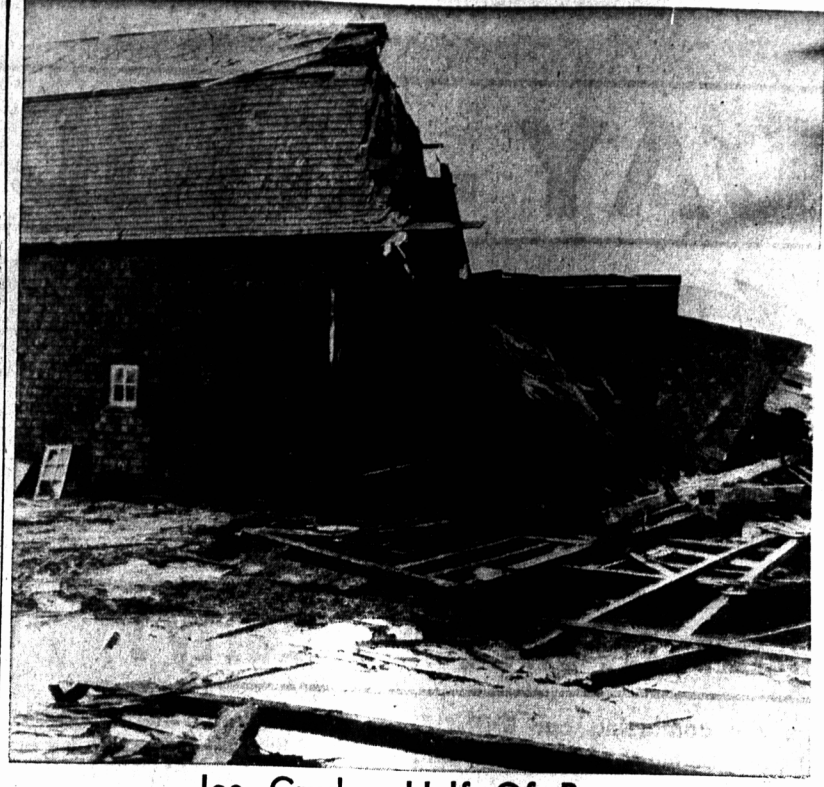
The extent of storm damage to wood lots and property in Prince County continues to be learned as communications are re-established. The large 120-foot barn, shown above, went down on the third day of the freezing rain storm. A 60-foot section of the building, owned by Mr. John T. Gallant, Plusville, collapsed under a heavy build up of ice. A wagon and other machinery was damaged but fortunately the farm animals were located in the part of the barn still standing and none were injured.

The extent of storm damage to wood lots and property in Prince County continues to be learned as communications are re-established. The large 120-foot barn, shown above, went down on the third day of the freezing rain storm. A 60-foot section of the building, owned by Mr. John T. Gallant, Plusville, collapsed under a heavy build up