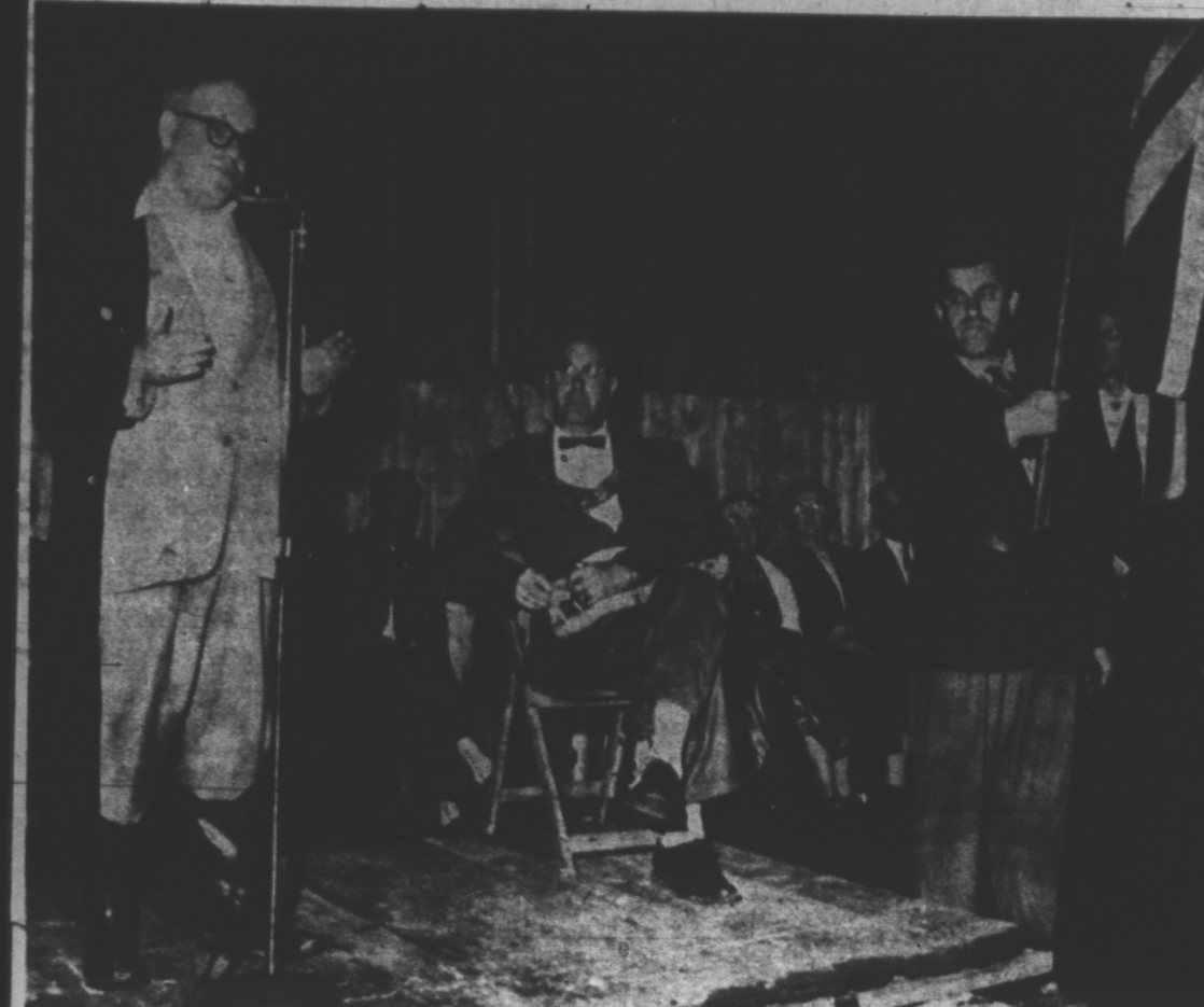
ORANGEMEN from all over the province gathered at Bedeque on Saturday for the annual Orange Tea which had to be held indoors due to the heavy rains.

Ask a West Berliner if he has any fear that the city will be sold down the river when the East-West negotiations resume in Geneva Monday, and he most likely will come up with: