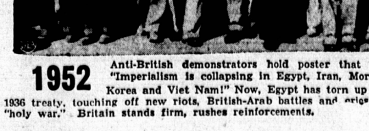
1952 Anti-British demonstrators hold poster that cries "Imperialism is collapsing in Egypt, Iran, Morocco, Korea and Viet Nam!" Now, Egypt has torn up the 1836 treaty, touching off new riots, British-Arab battles and other "holy war."