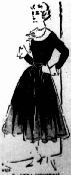
By VERA WINSTON