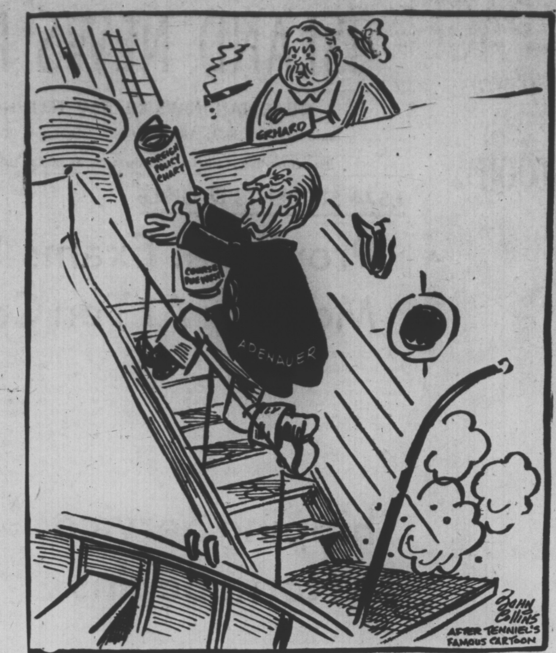
THE PILOT THAT WON'T BE DROPPED

All three opposition leaders were defeated in the Alberta elections on Thursday. Combined, their followers will scarcely amount to a corporal's guard in the next House. The Social Crediters practically swept the board in their seventh consecutive victory at the polls. Liberals who may be nursing hopes of doing the same thing in this Province should remember that Alberta has been riding the crest of the wave financially, with rich oil deposits that have turned staggering deficits into whopping surpluses, enabling the Manning Government to play Santa Claus to the voters on a scale unparalleled in Canadian history.