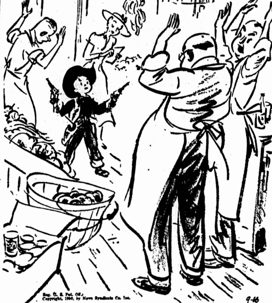
"I know they're good customers but I'm getting pretty tired of this!"