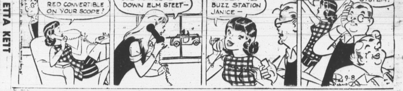
HI! STATION! ETTA CALLING! HAVE YOU GOT A RED CONVERTIBLE ON YOUR SCOPE? STATION DONNA REPORTING! RED JOB TRAVELING DOWN ELM STREET— GOOD! KEEP HIM ON YOUR SCREEN—I'LL BUZZ STATION JANICE— WINGEY'S OUT WITH ANOTHER GIRL! IT'S MY PRIVATE TRACKING SYSTEM!