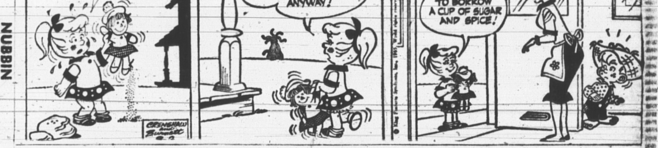
MERCY! SUBIE'S LOSING ALL HER SANDPIST! I NEVER LIKED THE IDEA OF HER BEING MADE OF SANDPIST, ANYWAY! I'D LIKE TO BORROW A CLIP OF SUGAR AND SPICE!