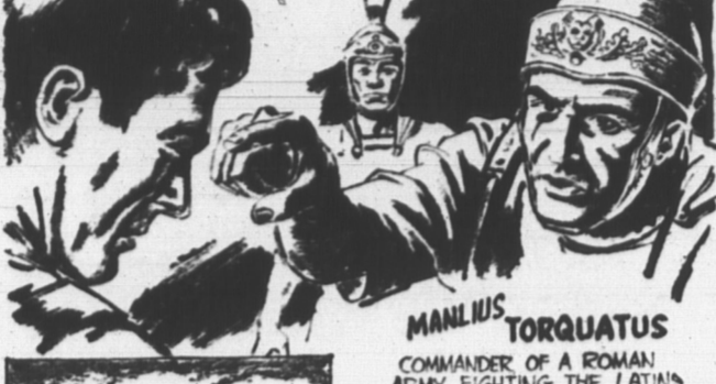
MANLIUS TORQUATUS COMMANDER OF A ROMAN ARMY FIGHTING THE LATINS HAVING RULED THAT NO MEMBER OF HIS FORCES COULD ENGAGE A FOE IN SINGLE COMBAT WITHOUT HIS PERMISSION EXCITED HIS OWN SON FOR LAYING AN ENEMY CHALLENGER (340 B.C.)