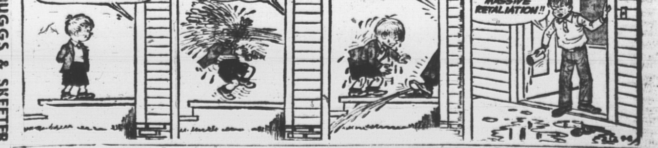
HELLO, THOMAS. I SAW YOU THROUGH THE WINDOW... AND I NOTICED THE WATER PISTOL CONCEALED BEHIND YOUR BACK... LET THIS BE A WARNING TO YOU... MY POLICY IS TO ANSWER A SNEAK ATTACK WITH MASSIVE RETALIATION!