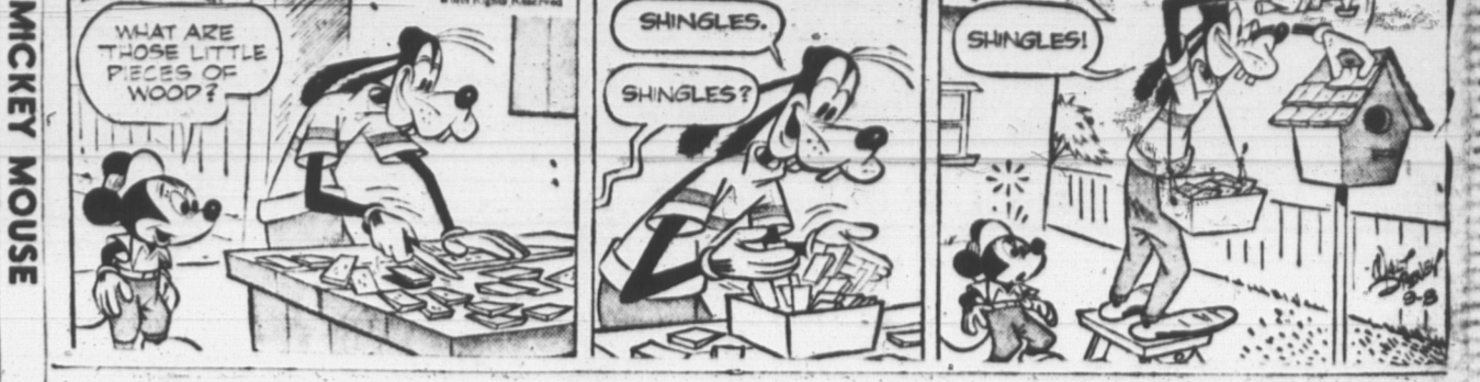
WHAT ARE THOSE LITTLE PIECES OF WOOD? SHINGLES! SHINGLES! SHINGLES!