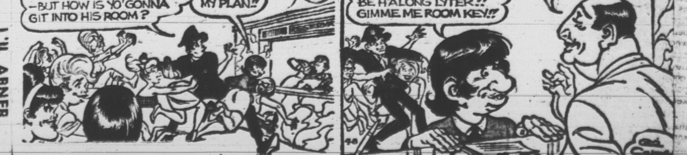
THIS IS HIS HOTEL, AWRIGHT— BUT HOW IS 'O GONNA GIT INTO HIS ROOM? IT'S ALL WORKED OUT IN MY PLAN! I—RUFF—BECOME SEPARATED FROM THE OTHER THREE!! THEY'LL BE HALONG LATER!! GIMME ME ROOM KEY!! CERTAINLY, SIR!!

GRANDMA MICKEY MOUSE ETTA KETT SECRET AGENT X-9 NUBBIN HENRY THE LONE RANGER JOE PALOOKA MUGGS & SKEETER L'L ABERN