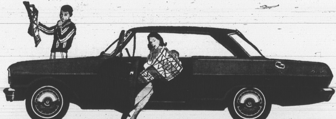
Chevy II Nova Sport Coupe