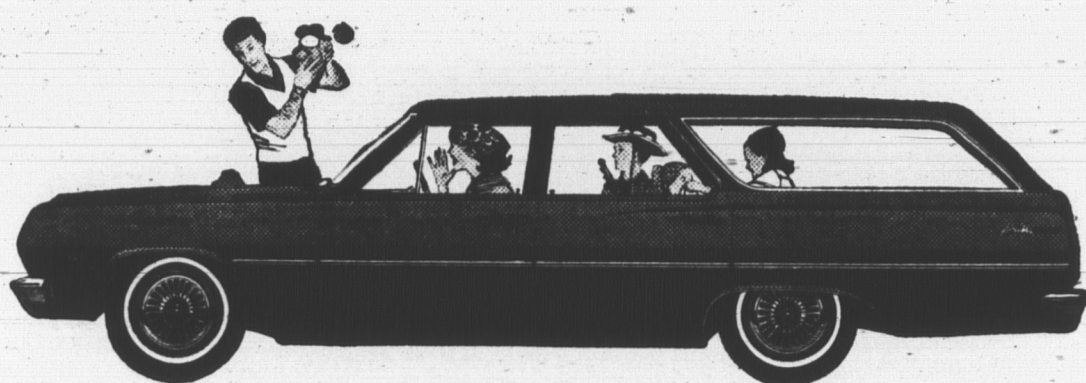
Chevelle Malibu 4-Door Station Wagon