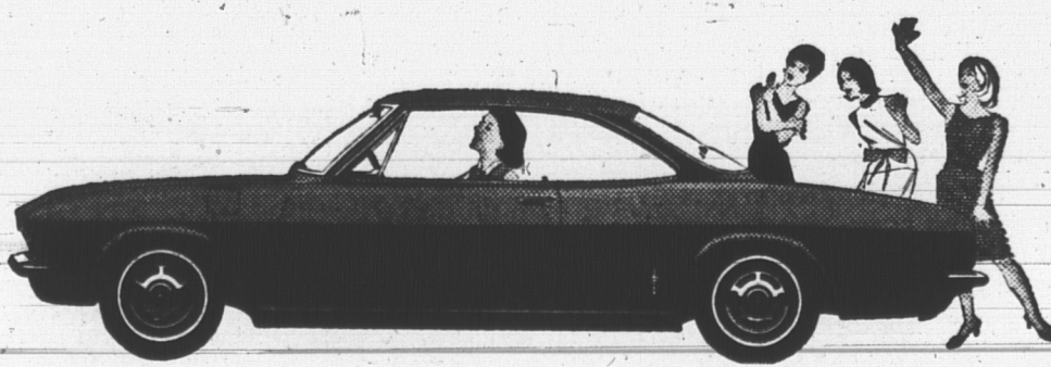
Corvair Corsa Sport Coupe