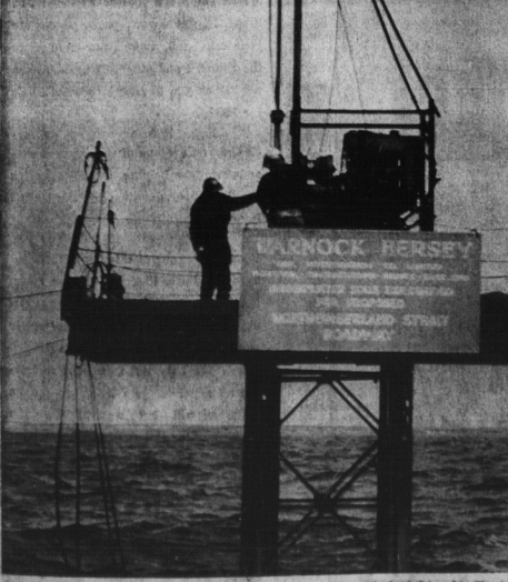
A CREW FROM WARNACK HERVEY SOIL INVESTIGATIONS LTD. DRILLS INTO BEDROCK FOR A NINE-MILE CROSSING OF NORTHUMBERLAND STRAIT. THE TEST BORINGS ARE A FIRST STEP IN THE FULFILLMENT OF A PLAN TO CON-

Successful completion of the first stage of tests for a monumental causeway between this province and New Brunswick, is announced by Warnock Hervey Soil Investigations Ltd. Test borings have been carried out for a nine-mile crossing of Northumberland Strait, which separates Bruden, P.E.I., from Cape Tormentine, N.B. Additional tests will be held next year, as part of a $250,000, two-year study for the Federal Department of Public Works to help determine whether the proposed link should take the form of a causeway, tunnel, bridge or combination structure. Construction could start in 1964 and would take six years.