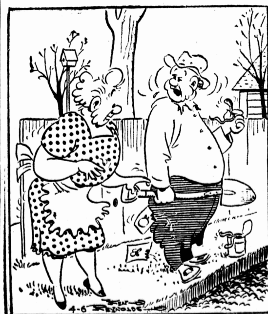
"You pick up worms—and I'll sell them for bait with a Guardian Want Ad!"