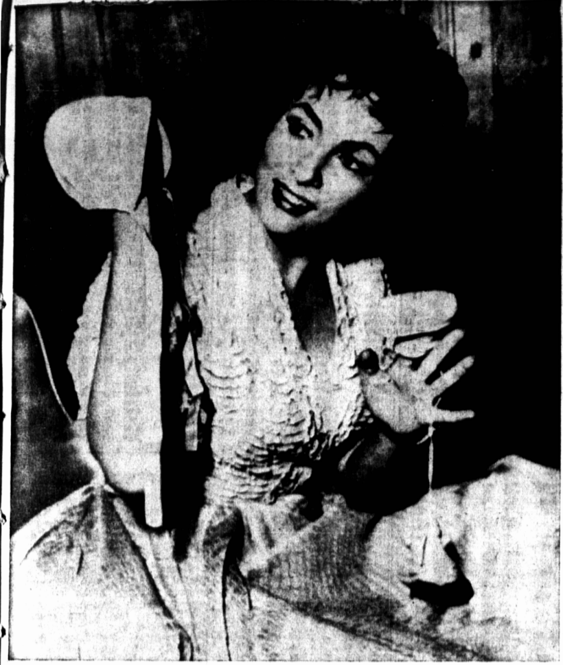
GINA PREPARES FOR FIRST BABY