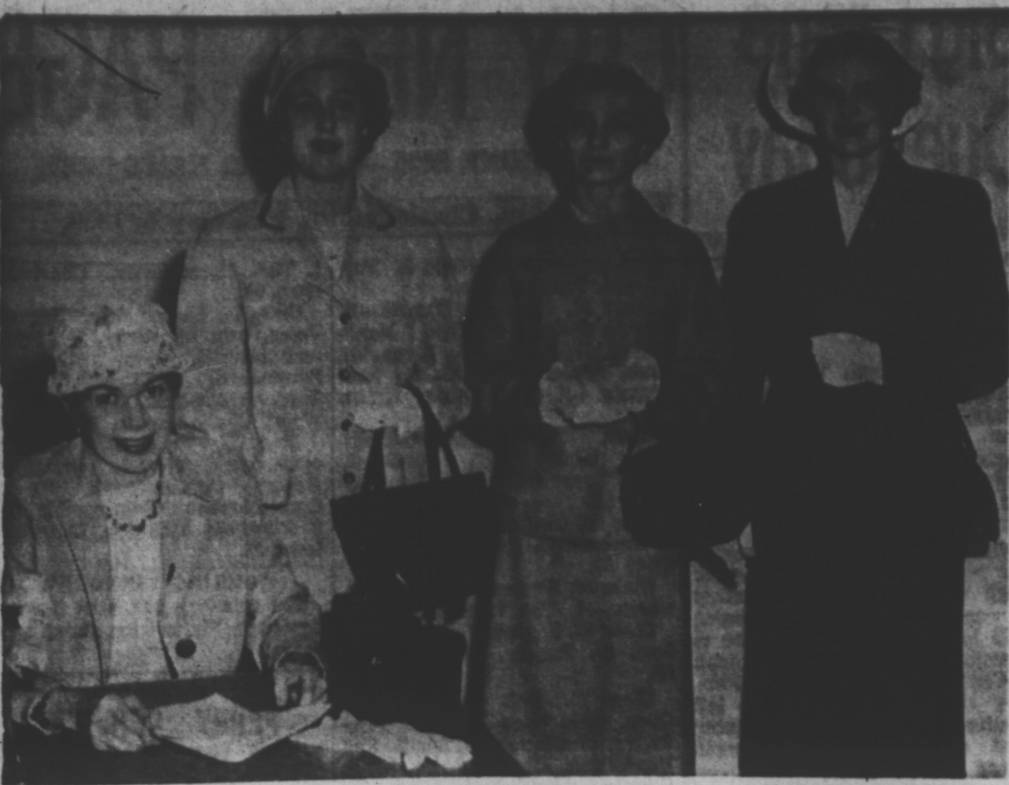
ACTIVE AT DAFFODIL TEA