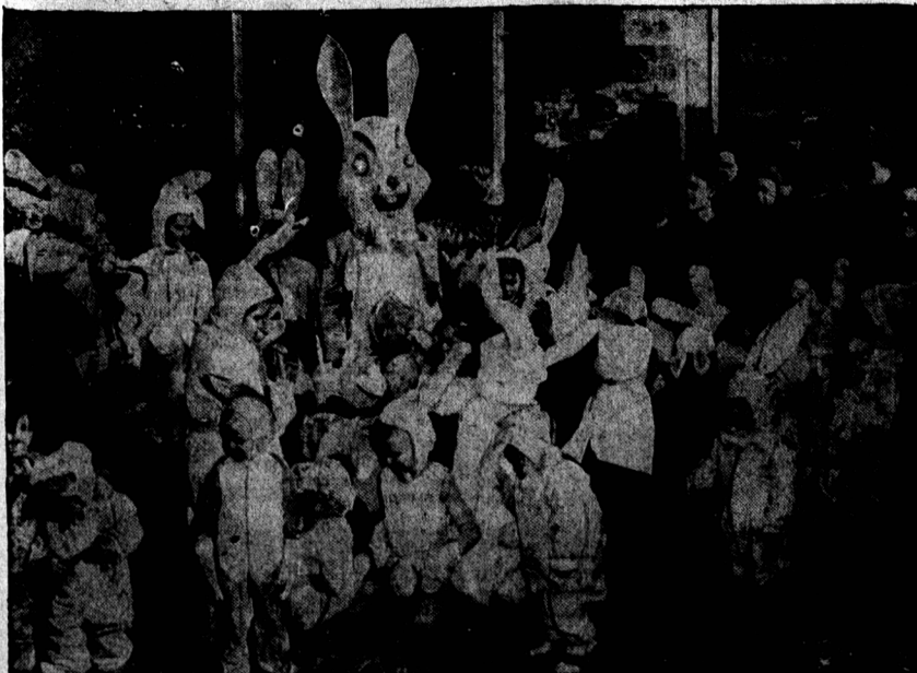
"WHAT'S UP, DOC?" —Well, Easter is coming, and Bugs Bunny and all the other bunnies are getting set for the annual Easter egg hunt. This was a pre-Easter hunt staged by a Wilmette, Ill., florist and the raft of bunnies you see are mostly kiddies in rabbit clothing.