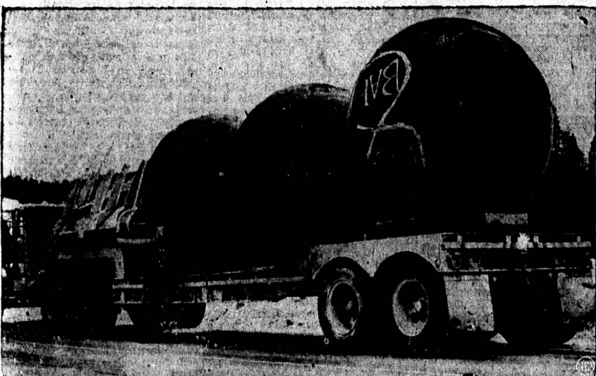
LAND CLEARERS GET "ON THE BALL" — Giant 4 1/2-ton steel balls, eight feet in diameter, are trucked to the 23,000-acre site of the Hungry Horse, Mont., reservoir for use in a novel scheme

of land-clearing. Big diesel dozers, hooked together with logging cables, will drive the heavy balls down steep hillsides to scrape off small trees and brush.