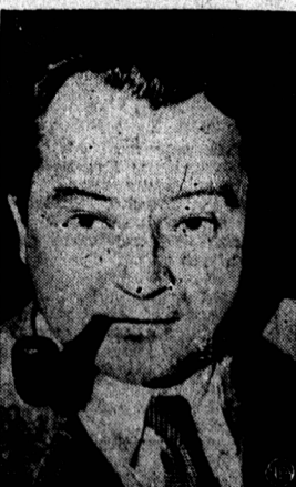
MAY FACE TRIAL — Vladimir Clementis, above whose "resignation" as Czechoslovak foreign minister was announced in Prague, may soon face trial in a great new Communist Party purge in Eastern Europe, diplomatic sources say. Clementis' departure leaves the Czech government almost entirely in the hands of "Moscow-minded" Communists.