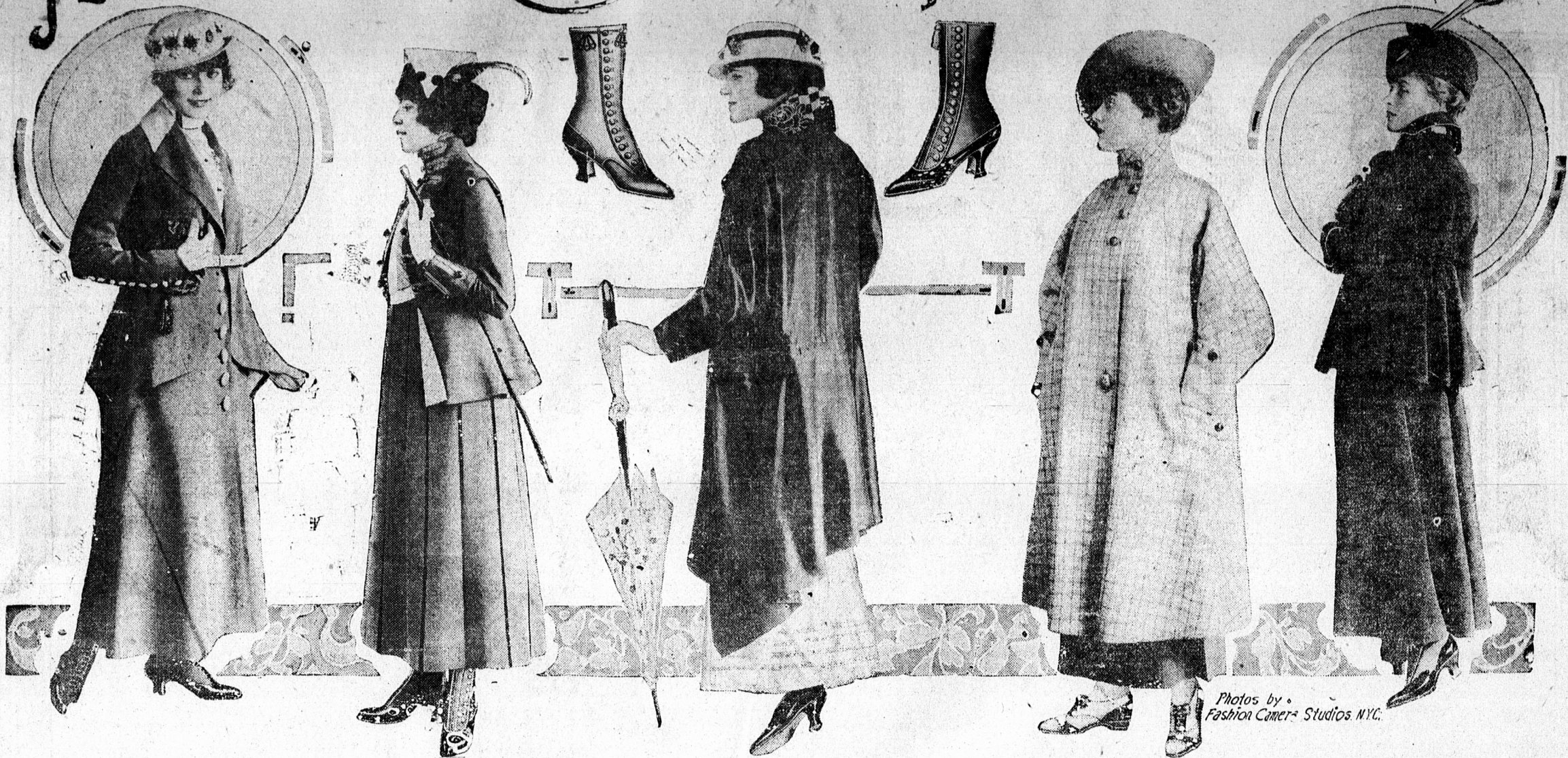
Here is a spring suit of sand colored garbardine and the ripple coat is faced with white golden-rod satin, the ivory tone of the satin being repeated in buttons of ivory tint. The military collar is faced with satin and a belt of white kid defines the waistline. The short skirt is circular in cut and reveals smart walking boots with buttoned cloth tops.