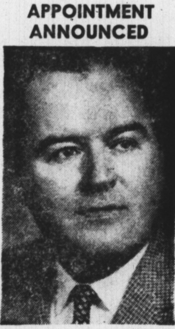
G. A. (Gordie) Drillon