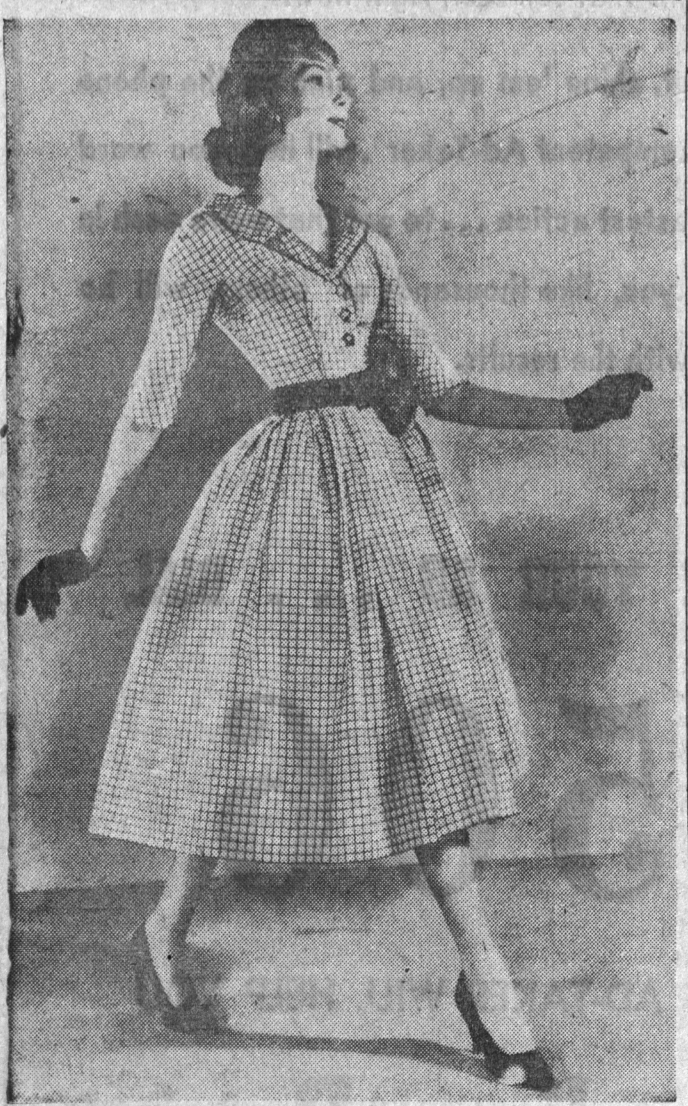
NEW SHIRTWAIST DRESS

The moonlight weaves its melody now on the farmlands. Against the dark leaves lie still. Only those on the poplar by the gateway sit in strange little rustles, in small silken whispers of sound.