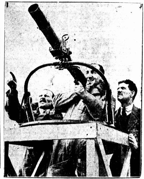
A Royal Air Force recruit tries his hand at a camera gun during target practice at the Civilian Flying Training school at White Waterham, Eng., where many new pilots are being trained as Britain rapidly increases her air force.