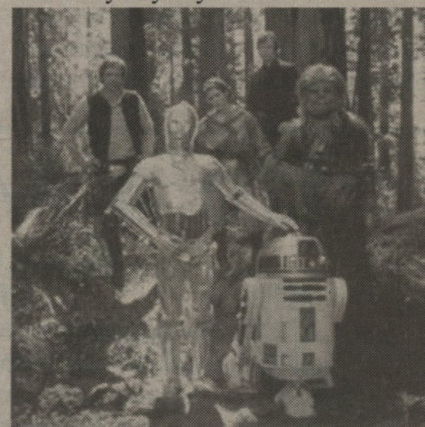
Example of friendships formed after society involvement

So there you have it! My condolences again to those clubs who didn't make it onto the list, but by now you must have members and activities underway anyway.