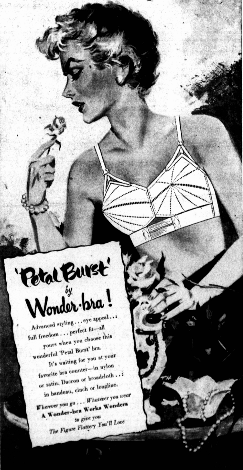
FIGURE FLATTERY you'll love...

JORDAN SEIZES ARMS AMMAN, Jordan (AP) — The Jordan government announced Saturday the seizure of large amounts of Czech - manufactured arms near the Syrian - Jordanian border.