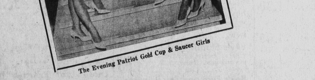
The Evening Patriot Gold Cup & Saucer Girls