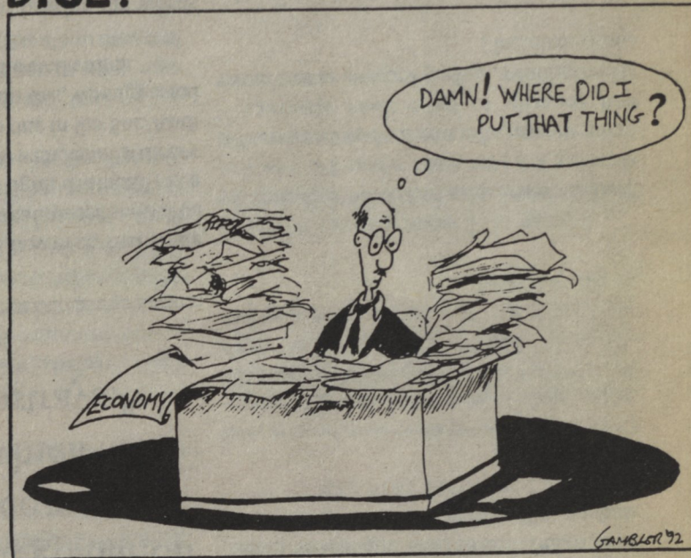
THE GOVERNMENT TURNS TOWARDS OTHER ISSUES...