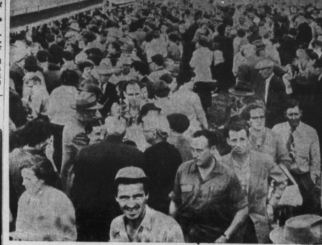
ALL ROADS LEAD TO DUNDAS THIS WEEK

chains—they are not named in the report—had 36 per cent of the sales. Percentage of chain - store business regionally: Atlantic provinces 27 per cent, Ontario and Quebec 49 per cent, the western provinces 54 per cent. The five biggest chains had 21 per cent of the business in the Atlantic area, 43 per cent in the central provinces and 38 per cent in the west. ATTRACTS YOUNG There are some 319,000 members aged 12 to 25 in the Lutheran Church in America.