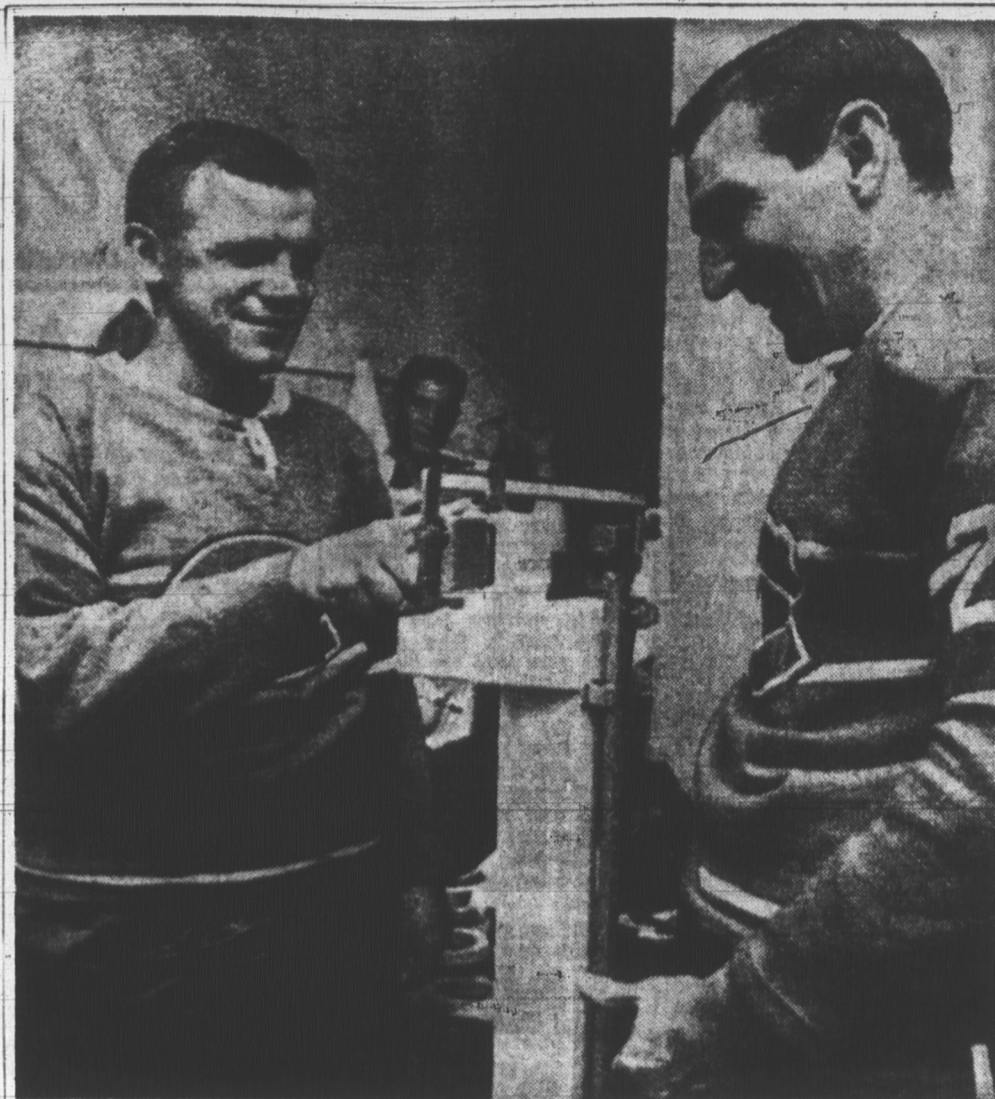
Centre Ralph Bakstrom, LEFT, checks weight of left-winger John Ferguson as Montreal Canadiens opened their pre-season training camp at the Forum Friday. Fifty-eight players are attending the Montreal camp, including all members of last season's Stanley Cup winning squad.

hitting a run-scoring single in the third inning at Wrigley Field. It was the first game of a double header.