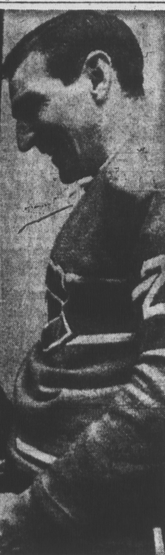
Montreal camp, including all members of last season's Stanley Cup winning squad.