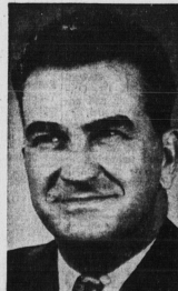
The Hon. J. Angus MacLean Queens County

will speak in Prince Edward Island on Thurs., Mar. 14th on behalf of these Conservative Candidates: