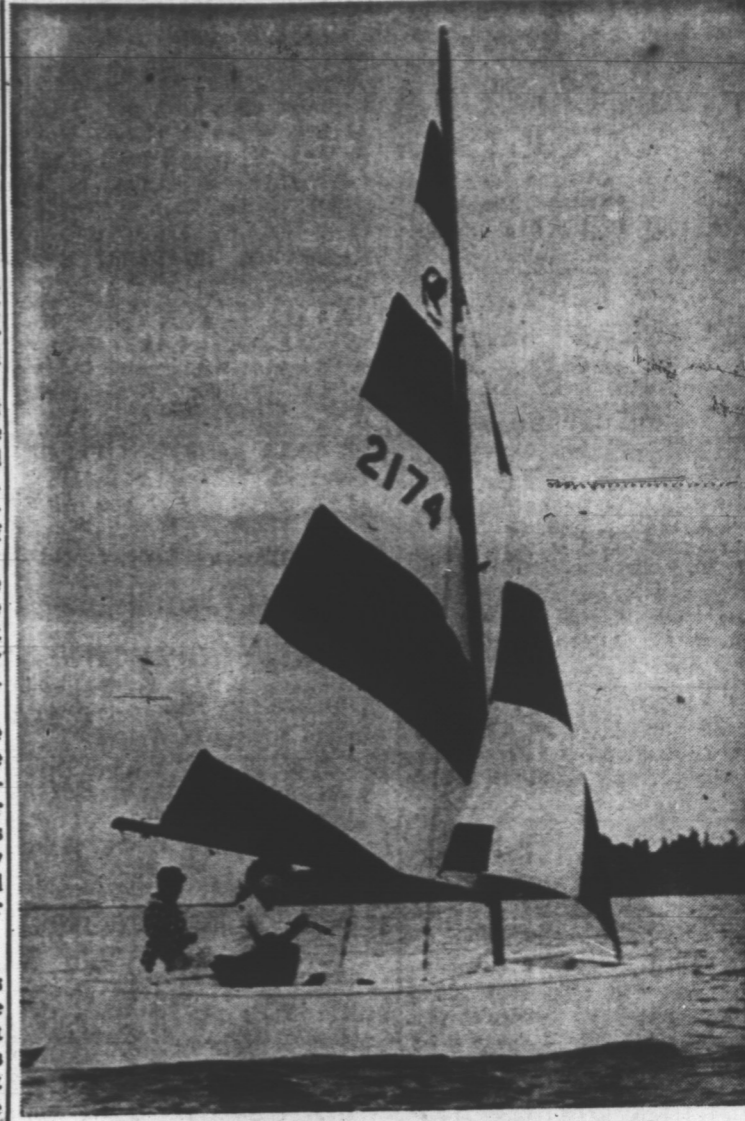
AT MONTAGUE REGATTA