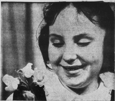
SWEET PEAS IN BLOOM