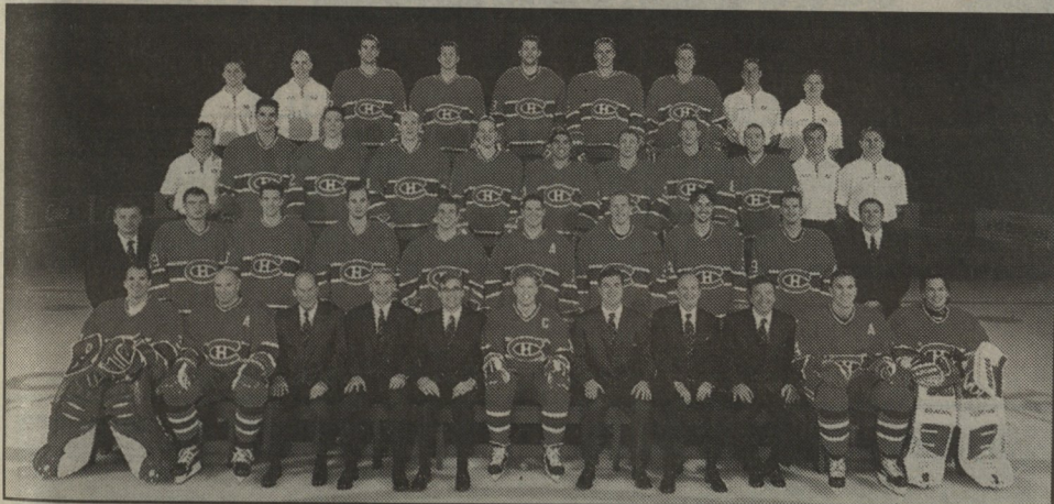
The Habs ain't got nothin' on the Panthers.

Montreal cleaned house and sent head coach Réjean Houle, and general manager Alain Vigneault on their way. In their places are Michel Therrien as head coach and André Savard as GM. Hopefully this will light a fire under the Canadiens' collective a** and get them back up in the standings.