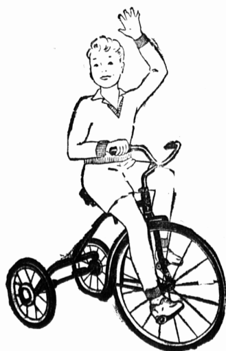
C. C. M. JOYCYCLES

Fun, Health and Happiness For Your Girl or Boy!