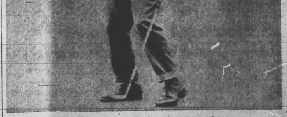
VENTURI TRIES BODY ENGLISH Ken Venturi proved to his hometown followers he could still play winning golf by taking first prize yesterday in the Lucky International Golf Tournament in San Francisco. Venturi shook a prolonged slump to overtake Frank Beard who held a 4 stroke lead at the end of the first nine today. Here

All the players in the Rural Minor Hockey Paperweight Division are asked to be present at St. Dunstan's Rink Tuesday, Feb. 1, 1966 at 7:30 p.m. sharp, in order to have team pictures taken for Minor Hockey Night. Parents are requested to take their players in full uniform, so they will be able to return home immediately after the pictures are taken. There will be a hockey practice for Rural Minor Hockey Pee Wees at 8 p.m. at St. Dunstan's Rink Tuesday, Feb. 1, 1966 followed by a Bantam practice at 9 p.m. Pee Wee: Rangers and Hawks Bantams — Wings and Bruins