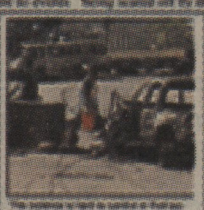
This picture is supposed to be a view of a flood in Haiti.