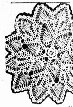
DESIGN NO. E-1069

1. What is wrong with this sentence? "Every man, woman and child waved their hand." 2. What is the correct pronunciation of "sumptuous"? 3. Which one of these words is misspelled? Comparative, combustible, comodity. 4. What does the word "antipathetic" mean? 5. What is a word beginning with gra that means "vividly described"? ANSWERS 1. Say, "waved his hand." 2. Pronounce sum-pu-tus, tu as in picture, and three syllables, not sun-chus. 3. Commodity. 4. Naturally contrary or opposed. (Accent first and fourth syllables). "The solemn violence of Sir Edward Carson was intensely antipathetic to Mr. Britling." — H. G. Wells. 5. Grapher.