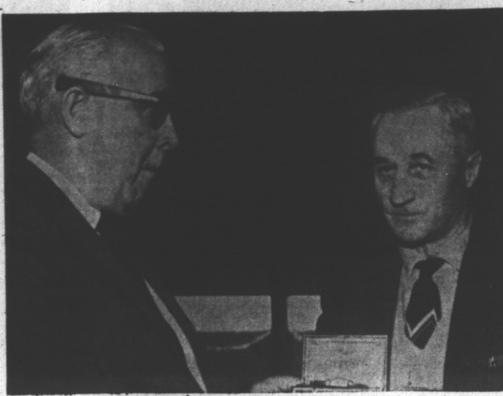
HONORED ON RETIREMENT