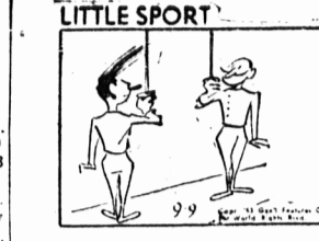
PAGE SIX THE GUARDIAN, CHARLOTTETOWN SEPTEMBER 9, 1953