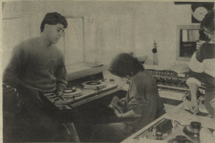
CIMN BACK ON THE AIR AGAIN,... FINALLY...