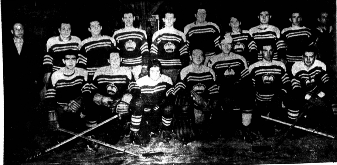
The Alberton Regals (shown above) won the Prince Edward Island — Nova Scotia Intermediate "B" hockey title at Alberton Saturday night eliminating the Springhill All Stars, N. S. Champions, 14-4 in a two game, total goal series.