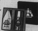
Gift Set $2.75