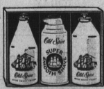
Gift Set $4.00

SANTA'S VISITING HOURS BOTH STORES 2 p.m. To 4 p.m. Daily