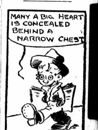
MANY A BIG HEART IS CONCEALED BEHIND A NARROW CHEST

Diplomatic events have moved swiftly during the 12-day adjournment, while the deterioration of the French military position in Indo-China has forced major western policy decisions. Politicians of Churchill's own Conservative party as well as the Labor opposition are anxious for a clear statement from the prime minister on Britain's possible role in Indo-China.