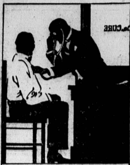
KEEP WELL BY SEEING A DOCTOR WHEN WELL

ONE man, sent to me by a prominent physician, tells me that he regards his doctor as a health engineer. He has trained his children to phone a doctor when any one of them feels physically uncomfortable. He tells his children it is their own fault if they are ever sick because if they go to the doctor in time he will prevent physical ailments.