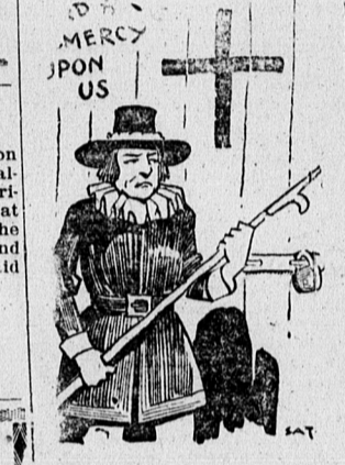
He BEHELD A MAN WITH A PIKE BEFORE A PAUL LOCKED DOOR.