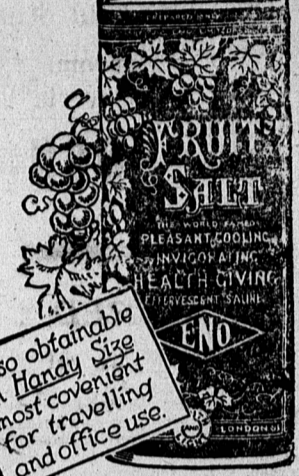
The words "Fruit Salt" and ENO'S and the label shown on the package are registered trade marks.

Prepared only by J. C. Eno, Ltd., London, England.