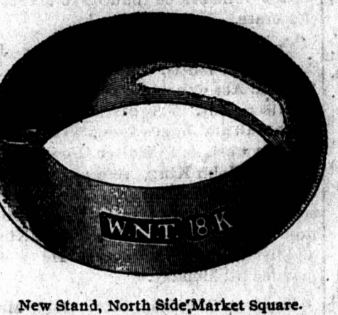
New Stand, North Side, Market Square.

The Only Kidney Medicine Entirely Free From Alcohol. The mortality reports from the large centres of population show that kidney troubles are as fatal, and carry off as many victims as consumption. Few men and women have perfectly sound kidneys. When an honest personal interest is awakened, it is found that there exist dangers. There is a pain in the small of the back, too frequent urination, cloudy urine, deposit of sediment, swelling of limbs, loss of strength, and in many cases, bladder difficulties add to the gravity of the situation. When you realize your danger, be wise make Kidney-Wort Tablets your chosen medicine; they will give you the results you seek for—freedom from a deadly disease. Whatever you do, we would warn you against the use of liquid medicines with alcohol in their composition. Alcohol will harrow and inflame the kidneys, and hasten death. Kidney-Wort Tablets stand so high in the estimation of physicians that they are used in hospitals and the best dispensaries. Kidney-Wort Tablets are a positive cure; give them a trial. All Druggists.