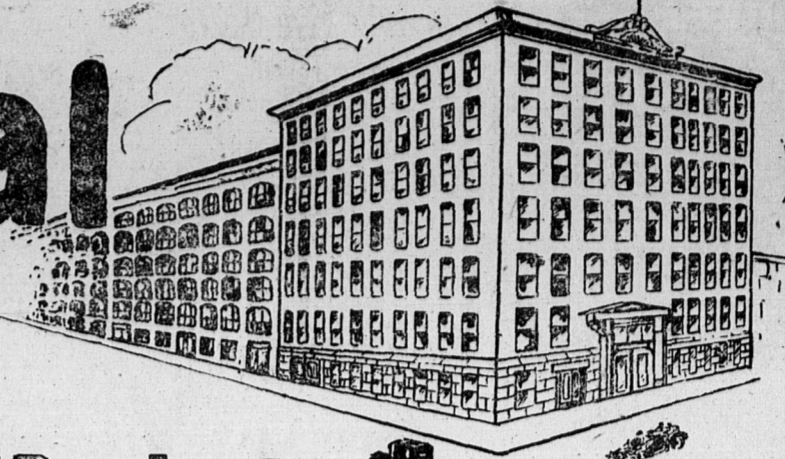
Head Office and Chief Warehouse Canadian Fur Auction Sales Co. Limited