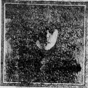
ALICE BRADY "IN THE HOLLOW OF HER HAND"