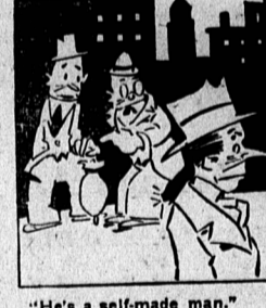
"He's a self-made man."