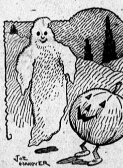
Hallow'en Ghost (to Jack-O-Lantern)—This is the night, old fellow.

COLD WEATHER JOYS The dreary days are here again, and Jack Frost on the window pane is sketching crystal stripes.