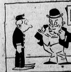
"Buddy, how high is this hotel?"

Engineers have estimated that there are 500,000,000 tons of iron ore in Mindanao, in the Philippines.