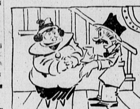
TO REWARD ME FOR MY FAITHFUL services by making me a buyer for the glove and hosiery departments, I hope.