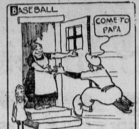
WHEN THE FAN GET REAL MAD, YOUR BET BET IS A HOME-RUN.