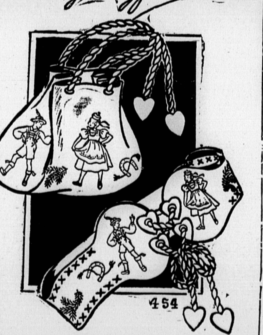
MAYFAIR NO. 454

This bright belt and matching bag is designed to give your new-season ensemble just the right dash and spirit. In a season when color is most important, it is appropriate indeed. Made of felt embroidered in wool or silk or woollen materials embroidered with silk twist. They are also most effective in novelty cottons, dress linens or heavy linen crash. Simple outline, single and cross stitches complete the embroidery.