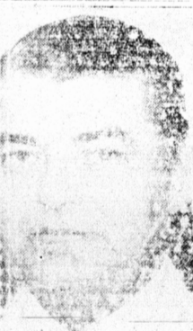
Commander H. West-Lessen who escaped from Guao in a flying boat, is in command of the Norwegian naval air force which will shortly begin training in Toronto.

Warm weather and timely showers have maintained favourable growing conditions. Good yields are anticipated for the main grain crops, although considerable lodging and some rust is reported. The fall wheat harvest is well advanced. Cutting of early-sown spring grains has commenced; late crops are filling and ripening rapidly. A heavy hay crop has been stored under difficulties due to frequent rains. Corn and roots are progressing favourably. Apples, especially late varieties, promise average yields. Below-average yields are forecast for peaches, pears and grapes, particularly in the Niagara district. Small fruits generally are satisfactory.