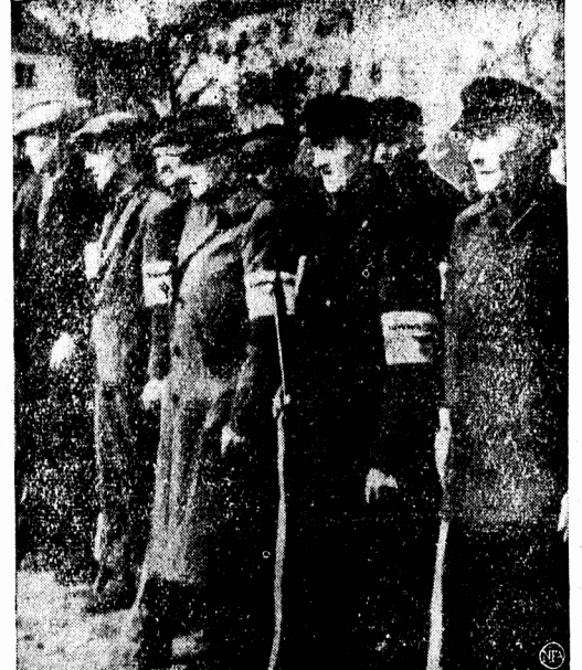
The photo above gives a good idea of the quality of the recruits Hitler gets for the "Volkssturm," the new German home army which he has promised would make a last-ditch fight when the Allies overrun the Reich itself. German caption on the photo, read from Stockholm, says the recruits, many of whom never had handled a gun, are lined up before target practice.