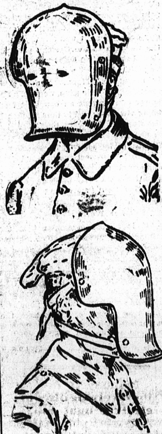
This steel helmet, worn by German sharpshooters on sniping duty, is formed of metal bent so that it will deflect bullets. It is out away on the right side to allow sighting the rifle.