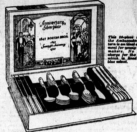
This 20-piece set in the Ambassador Pattern is an ideal arrangement for young house-makers. No extra charge for the chest, which is lined with blue velvet.